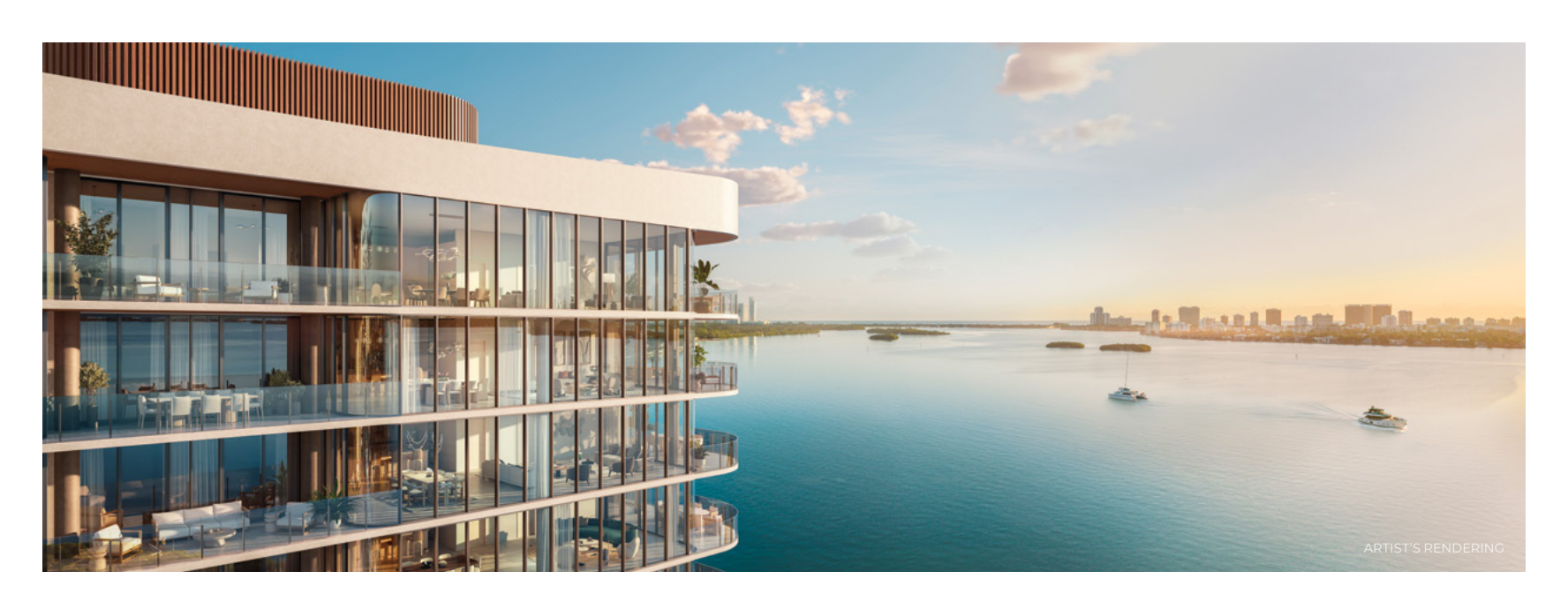
Two- to four-bedroom residences from $2.3 Million solanabay.com